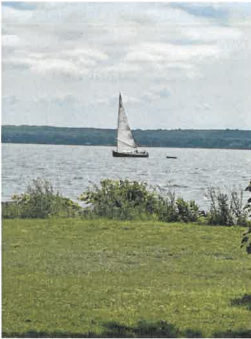
Denise spent a week in NY close to the 1000 Islands camping. This was her view from her campsite.