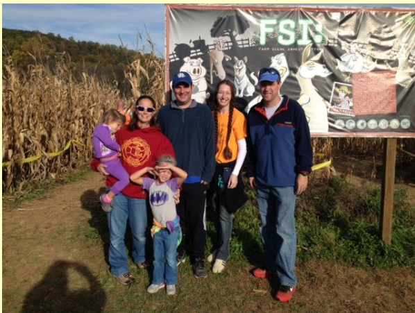
2017 Corn Maze