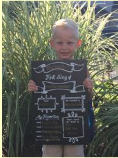
Mason's (Denise's grandson) First Day of Kindergarten