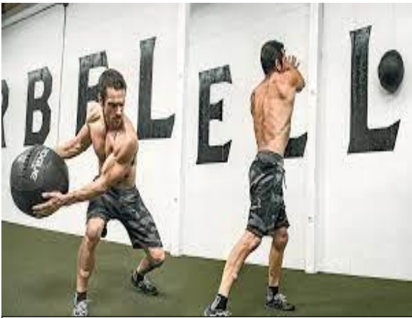
Medicine Ball Toss