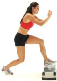
Alternating Toe Taps