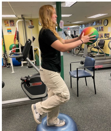
Catch While Doing Single Leg Balance on Bosu Ball

Throw the ball 30 times in a row, complete 3 times