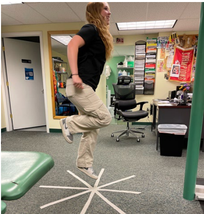
Single Leg Hop

Squat 15 times in a row, 3 separate times