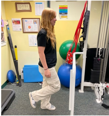
Single Leg Balance

Hold for 30 seconds and complete 3 times