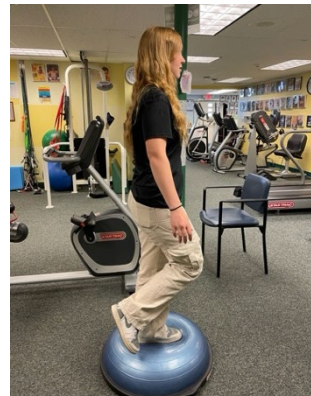
Single Leg Balance on Bosu Ball

Hold for 30 seconds and complete 3 times